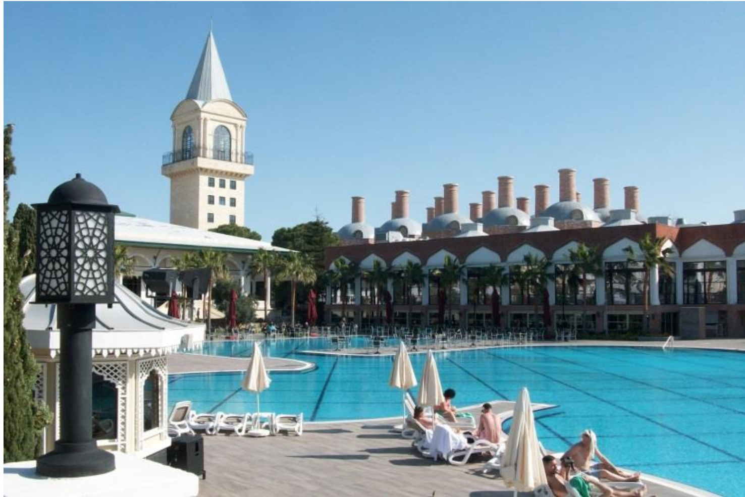
View of the Tower of Justice, the main swimming pool and the Hünkar restaurant from Sultan Ahmet Square