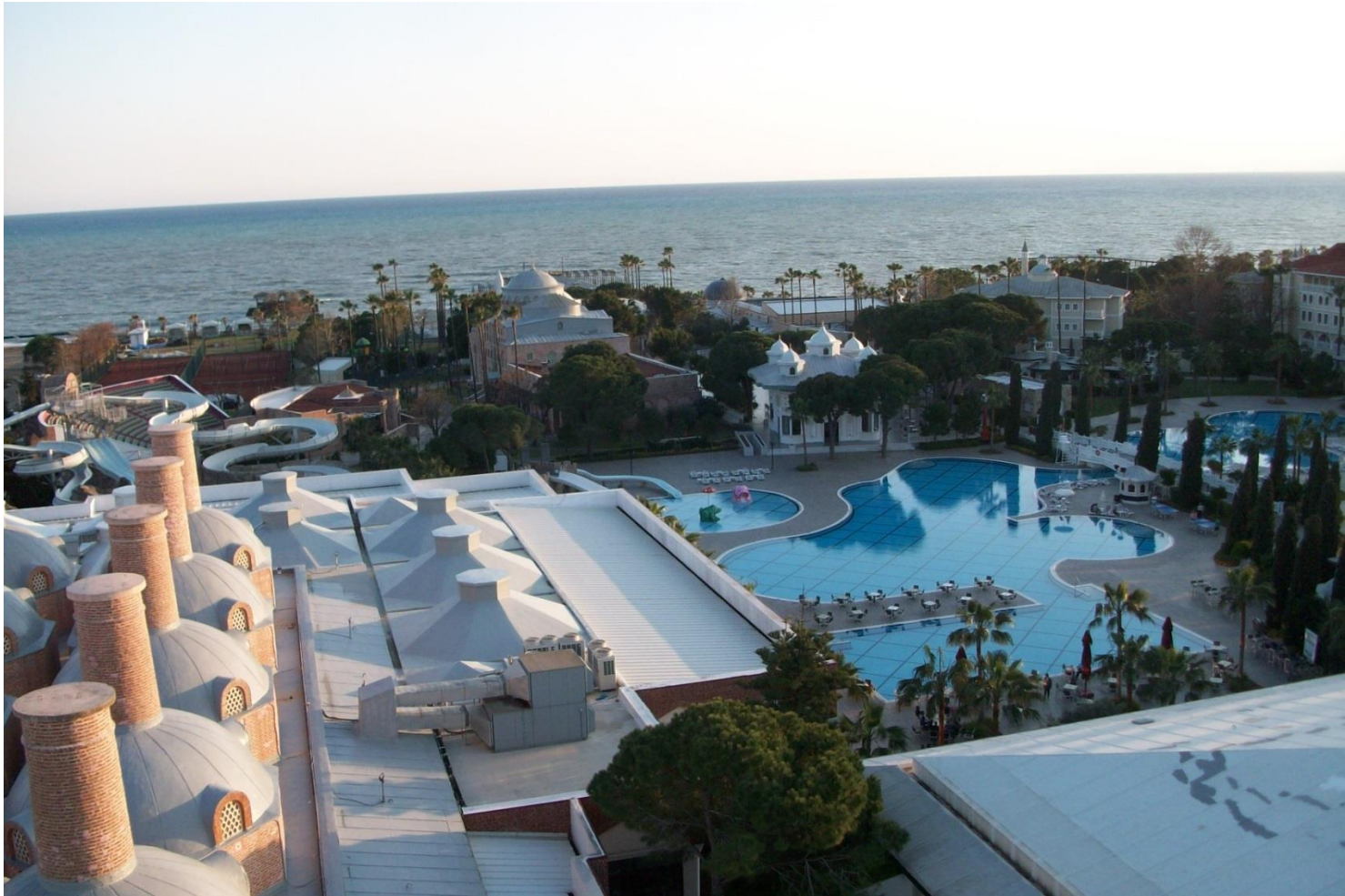
View of the pool and sea from the Tower of Justice