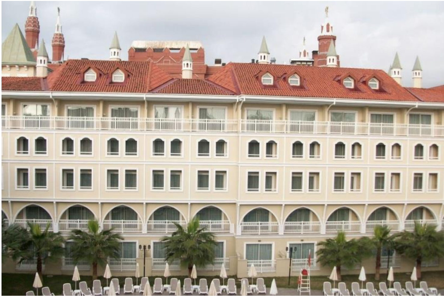
View of building No. 4