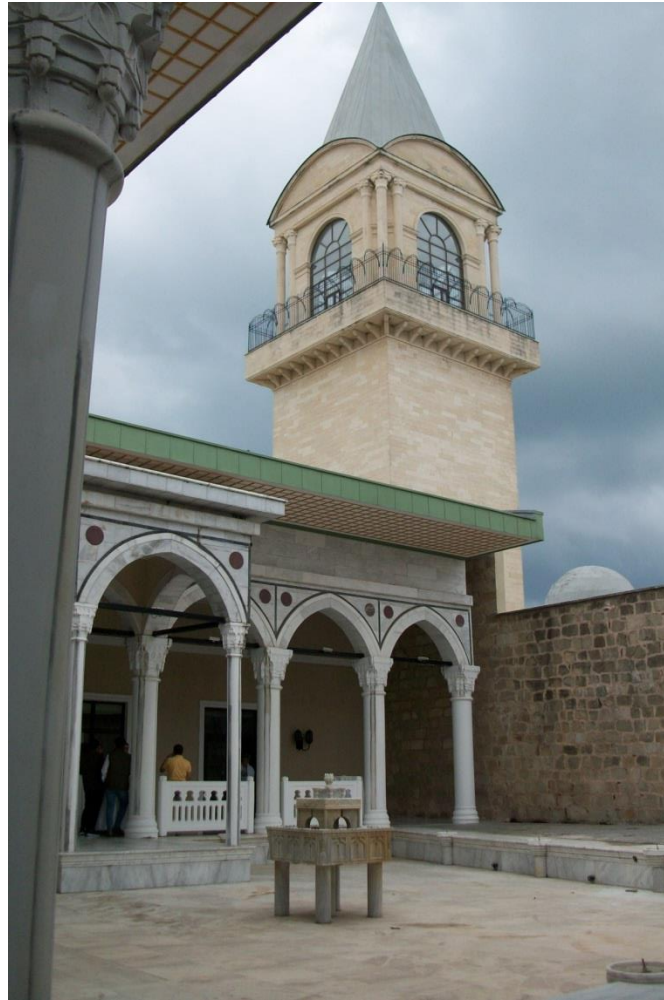
View of the Tower of Justice from the Sultan Ahmet Fountain