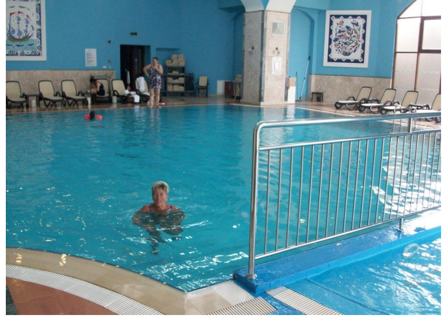
Two heated swimming pools