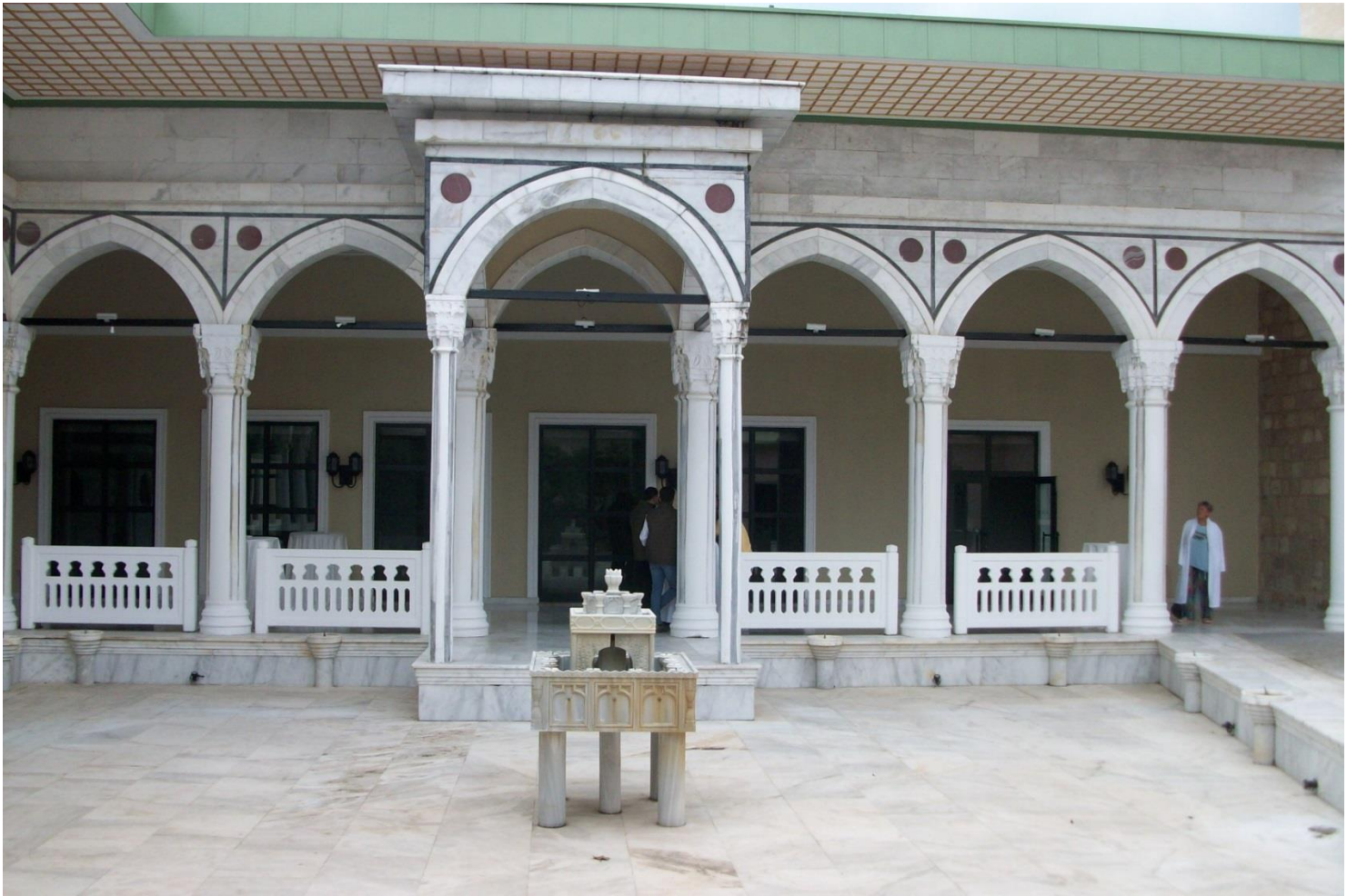
Sultan Ahmet Fountain (switched off in winter)