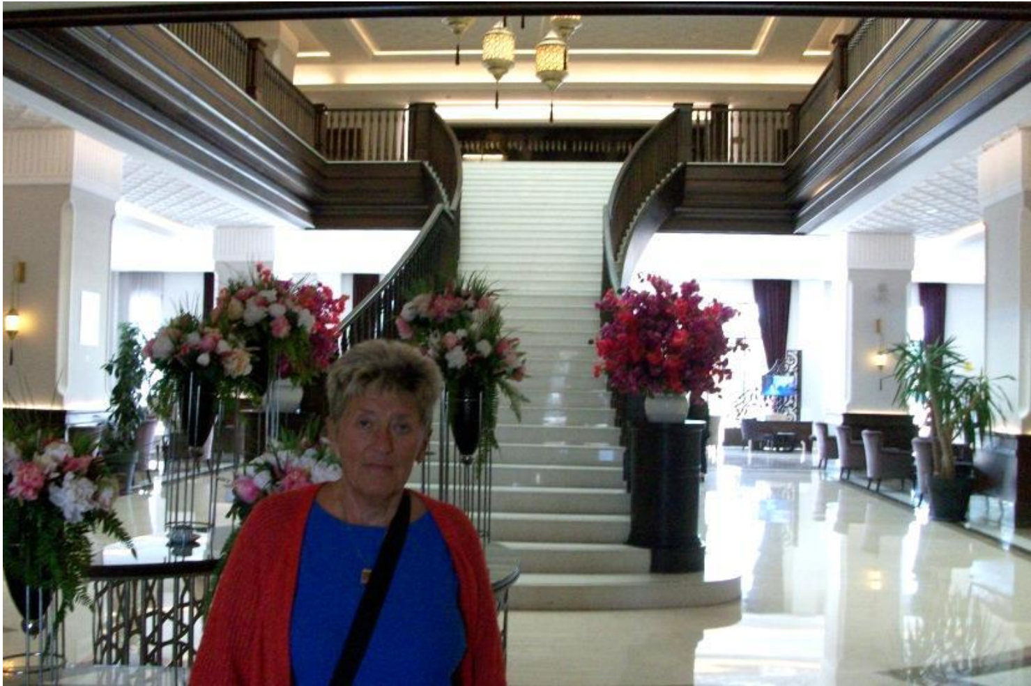
At the main staircase of the Topkapi Palace Hotel