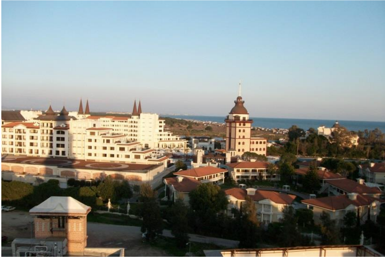
View of the Titanic Mardan Hotel (Maiden Tower on the right) from the Tower of Justice