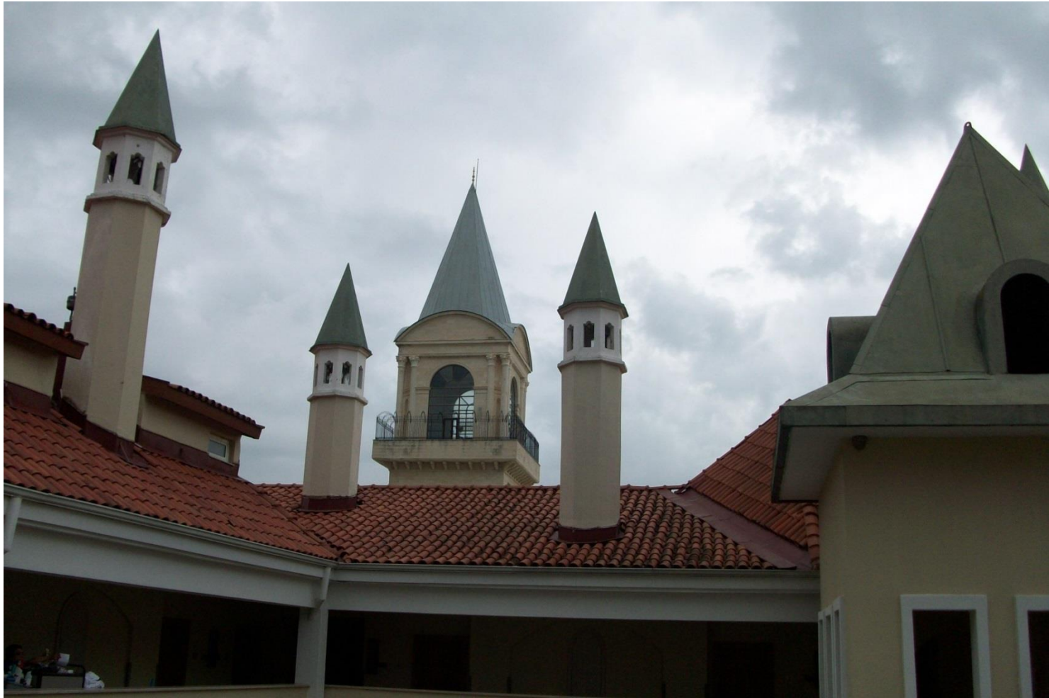
View of the Tower of Justice from building No. 2