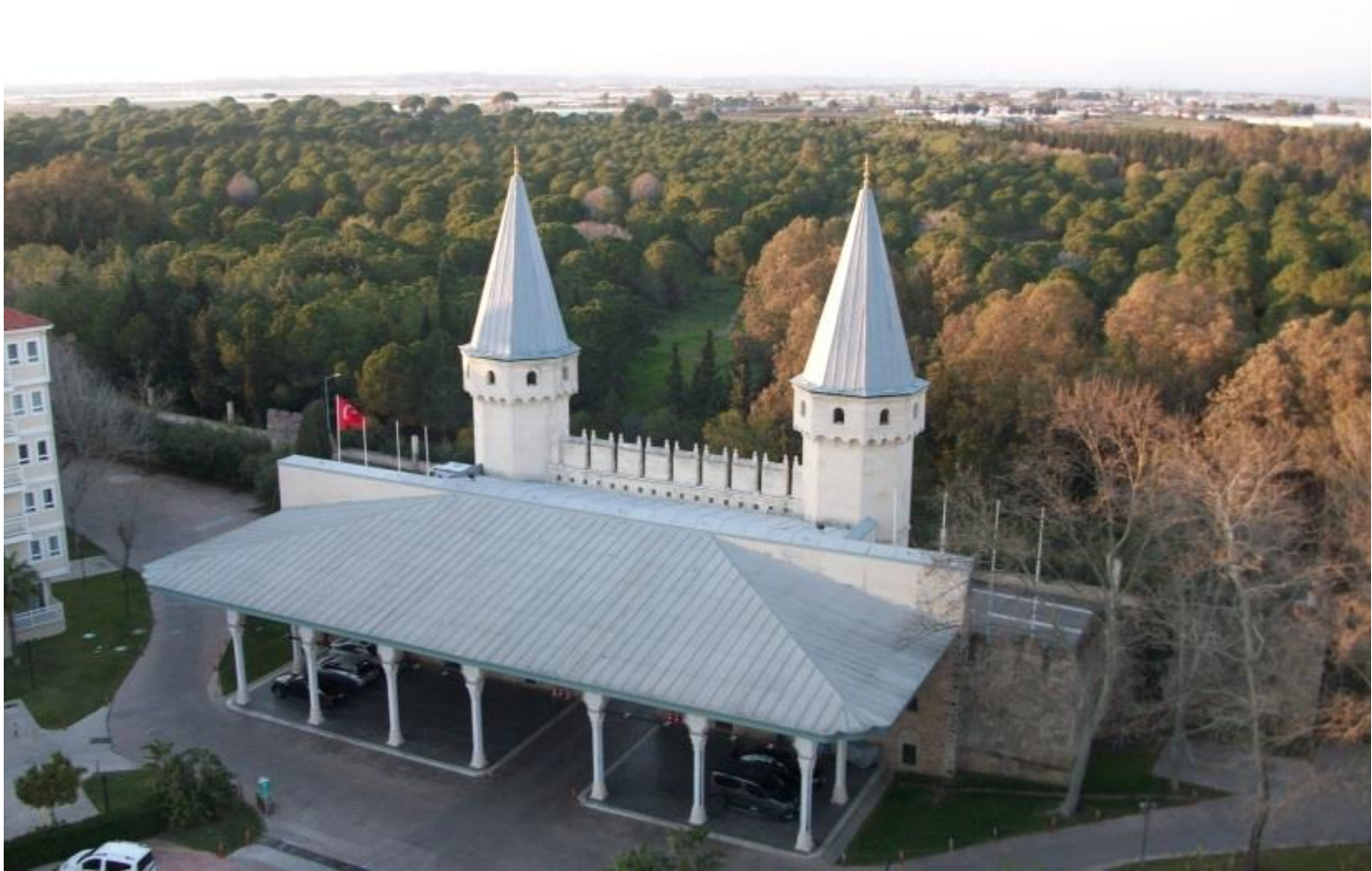
Main Gate Towers