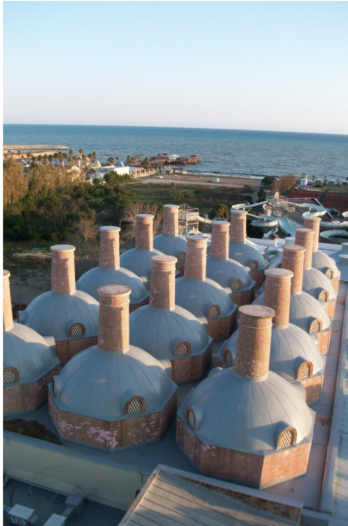
View of the roof of the Hünkar restaurant from the Tower of Justice