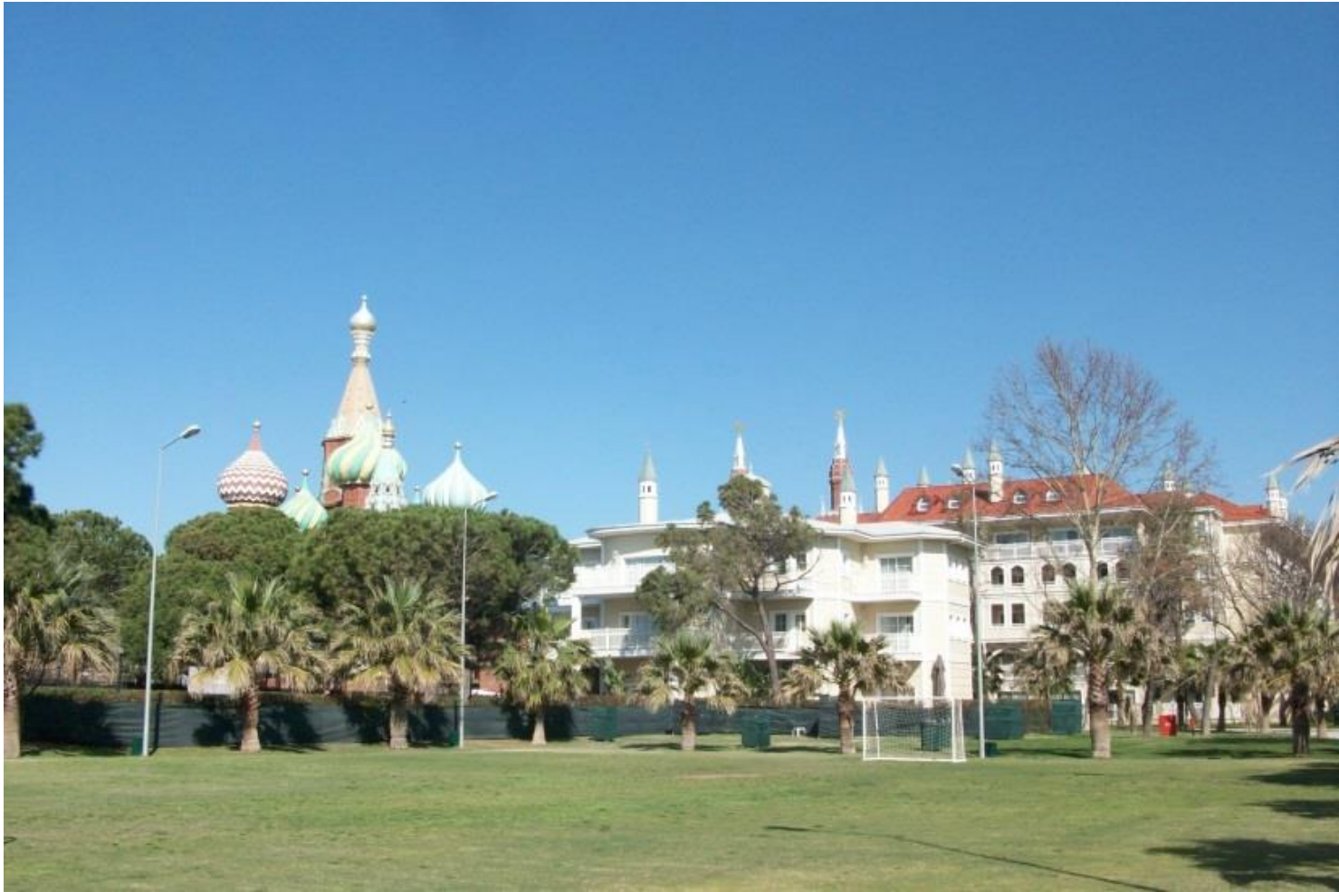
View of the Kremlin Hotel (left)