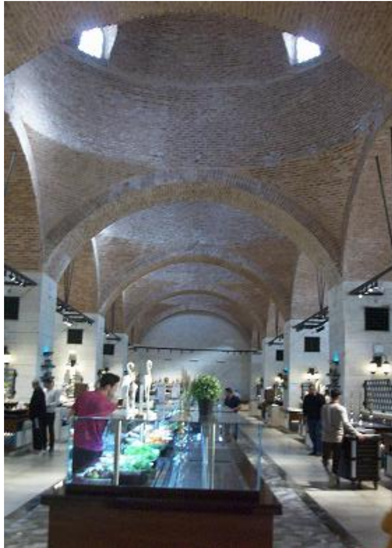
At the Hünkar restaurant