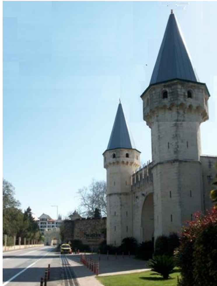
Main Gate Towers (Hotel Entrance)