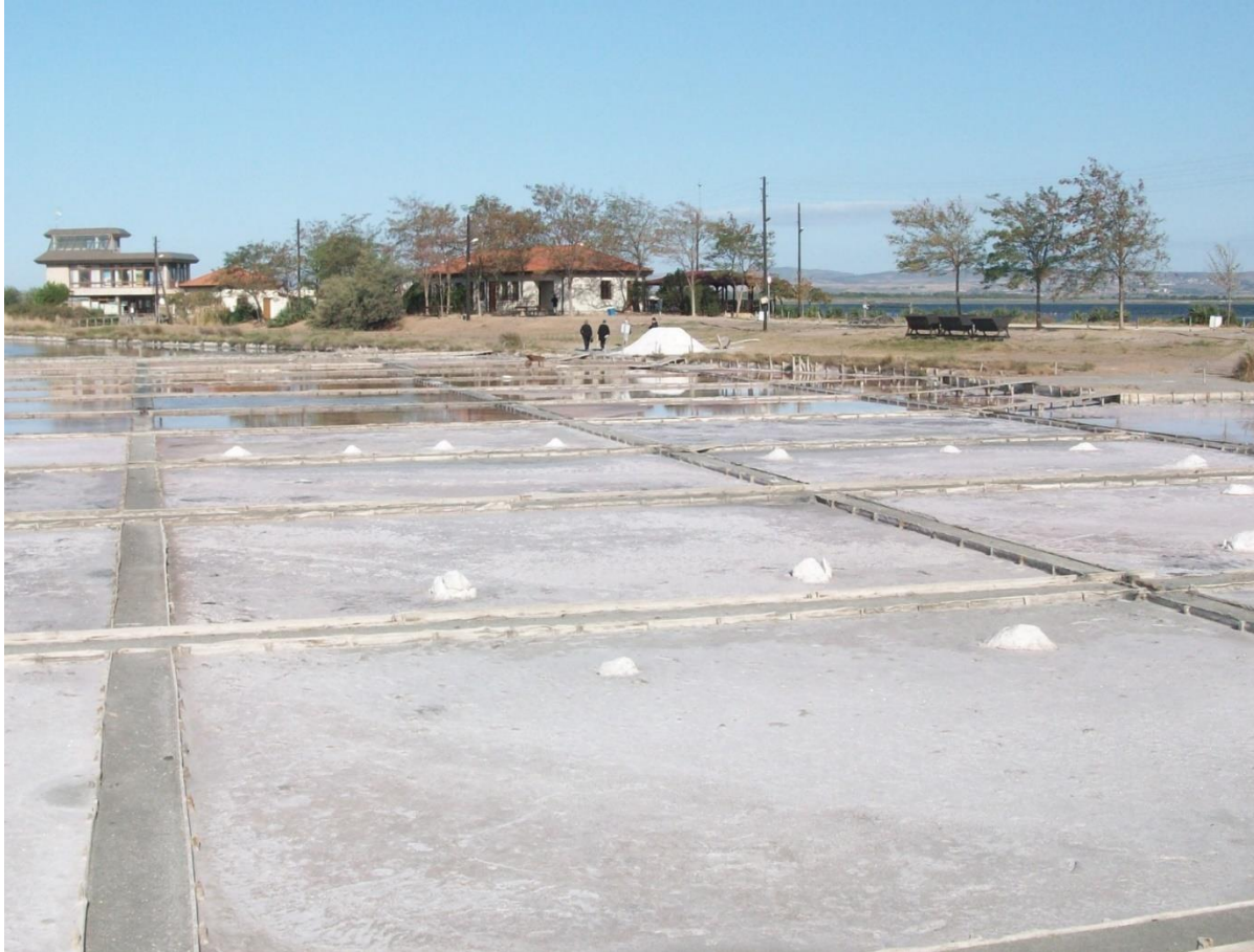
Salt mining at the salt museum.