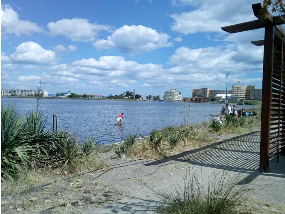
View of the lake and the hotel "Pomorie".