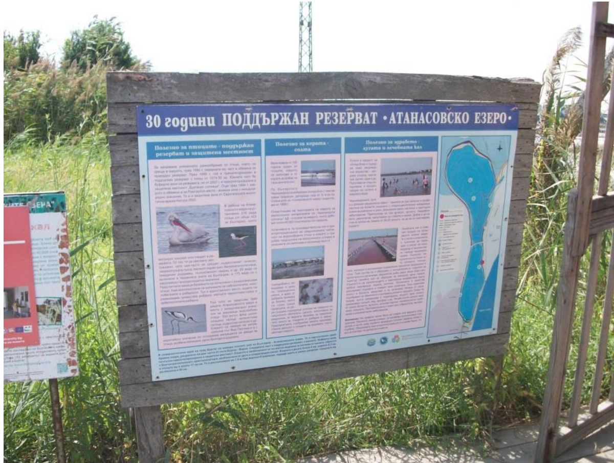
A poster about Lake Atanasov as a nature reserve. In 1980, the northern half of the lake was declared a protected area.