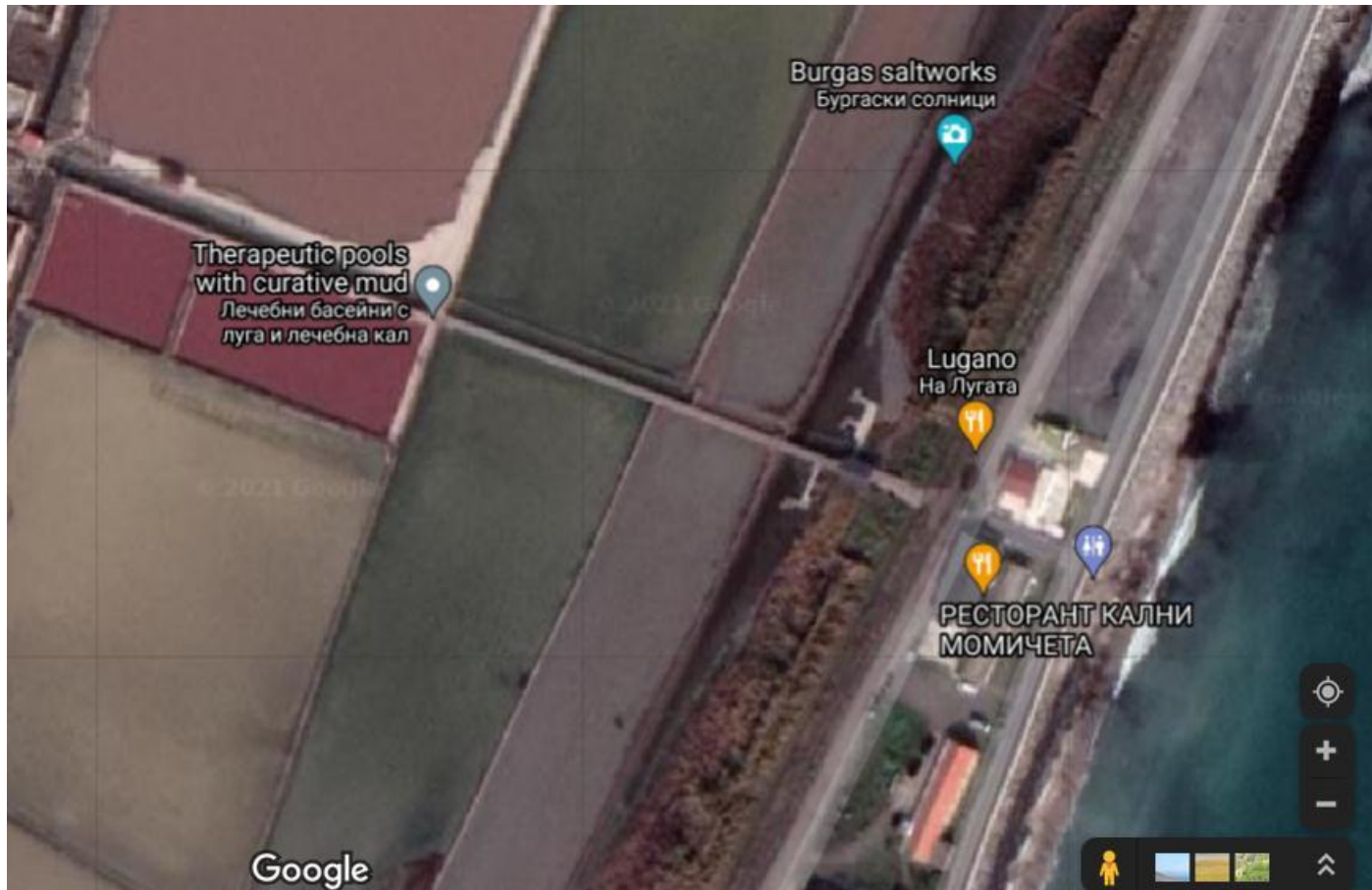
View of the mud baths on the photo map.