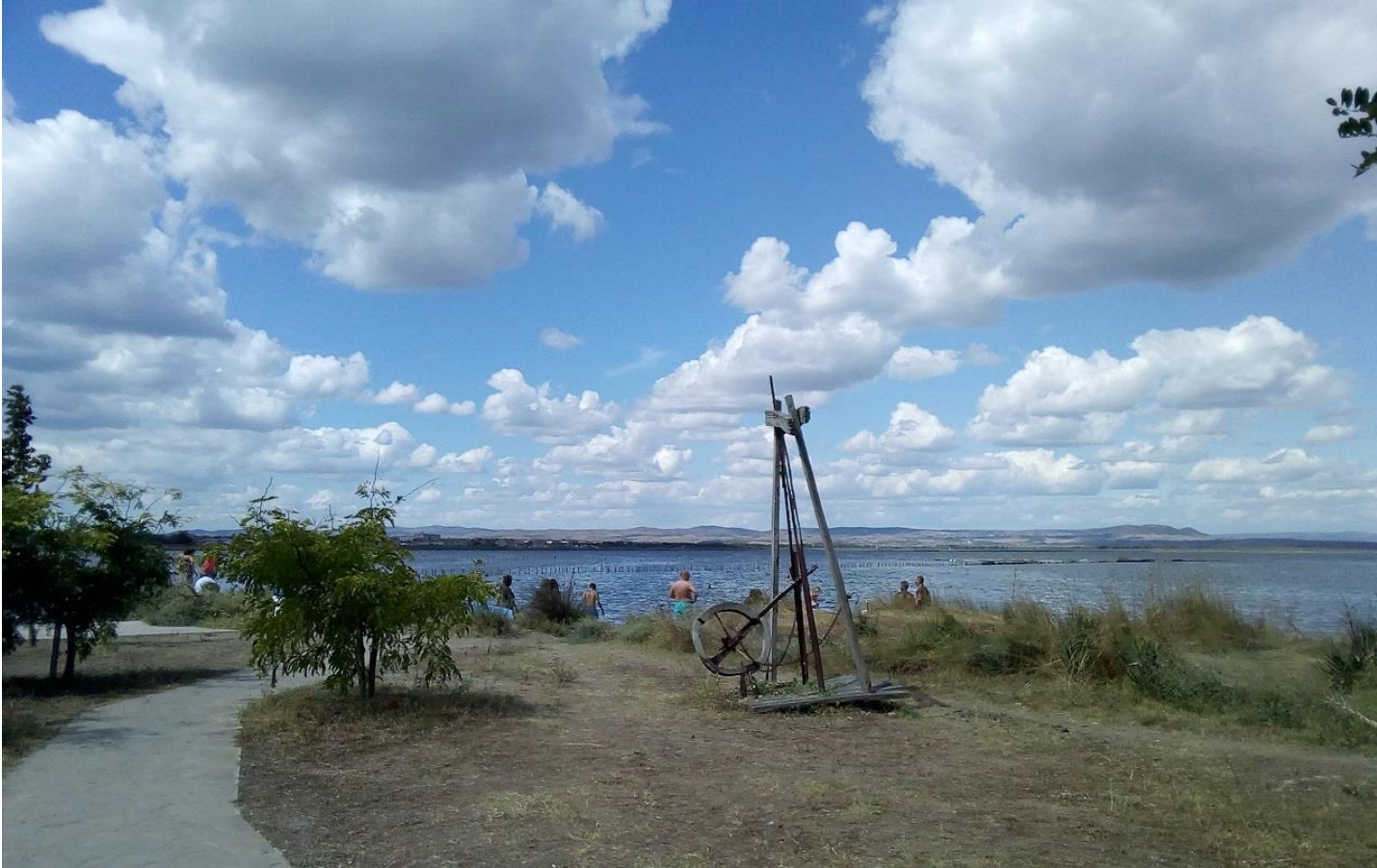
Lake view at the salt museum.