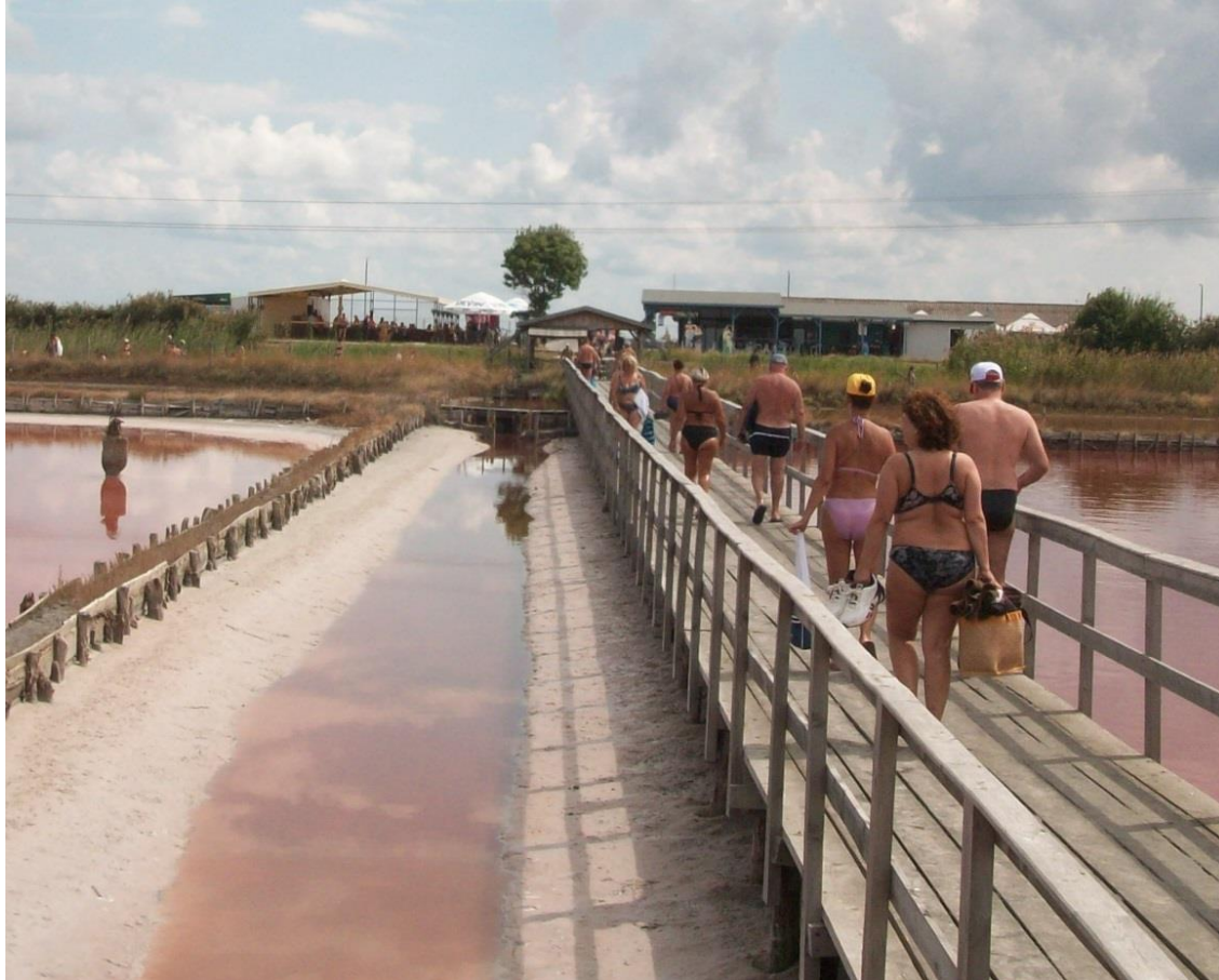
Salt healing ponds with pink water.