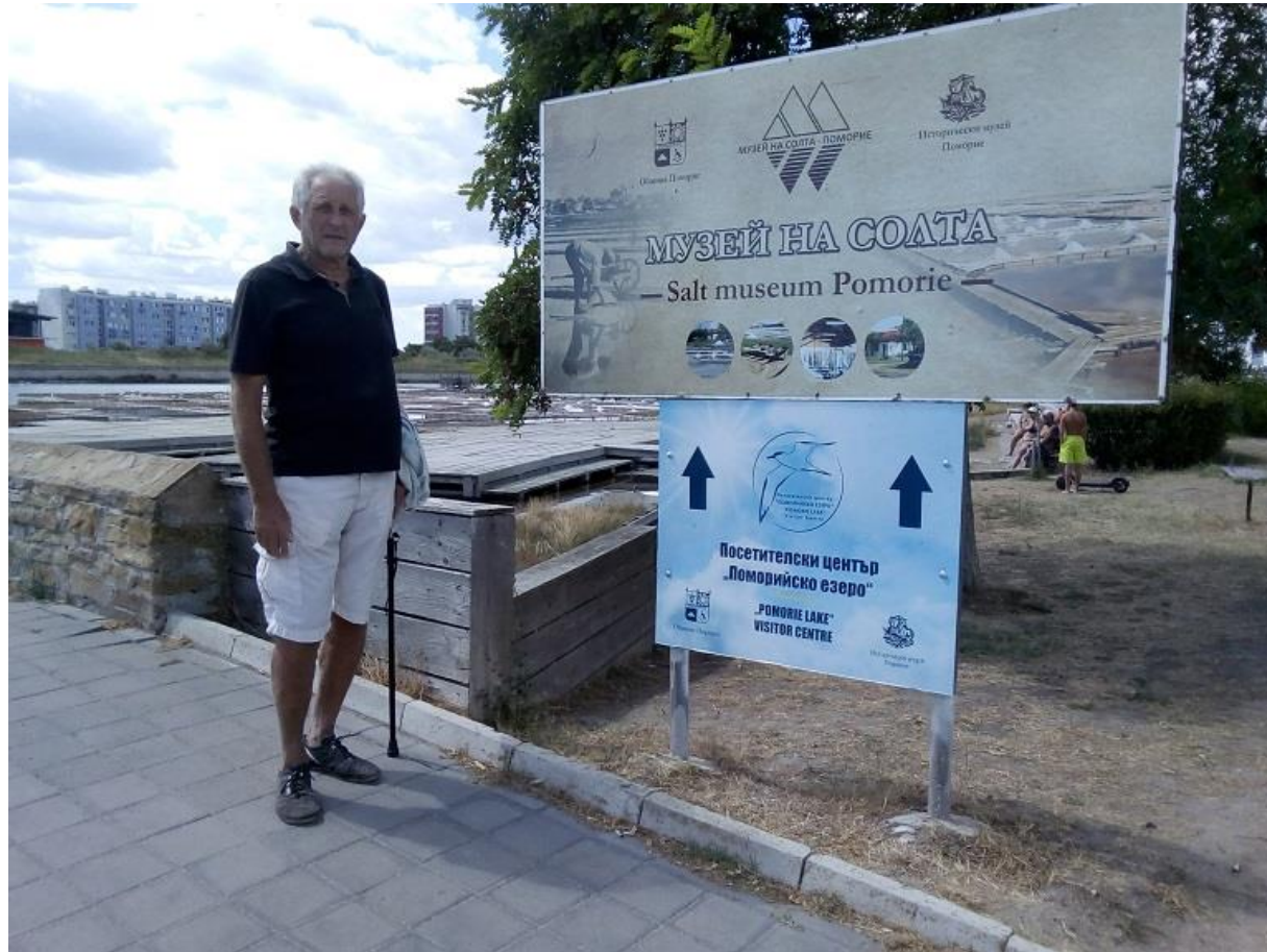
One of the authors at the salt museum